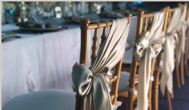
Chairs for rent