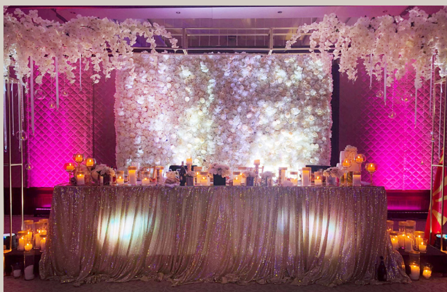
Bridal table decor